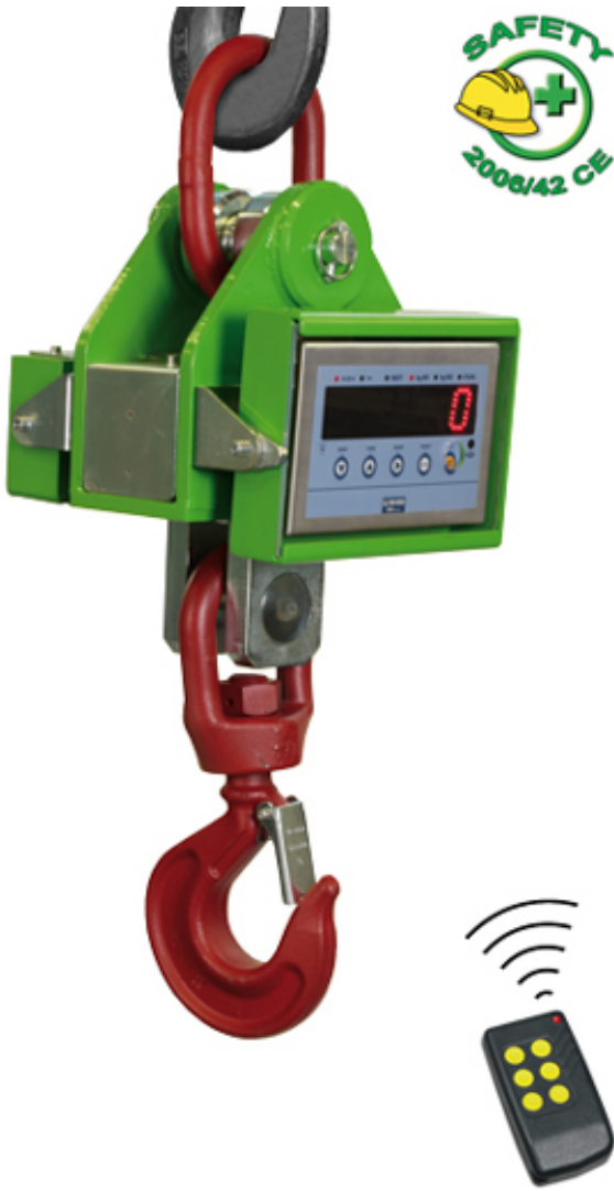
MCWHU with optional ring and swivelling hook